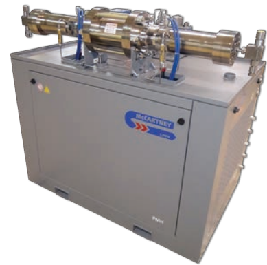
McCartney PMH Single & Dual Peroxide Injection Pumps - The McCartney PMH hydraulic-driven reciprocating metering pump has long been the industry Workhorse for initiator injection.

McCartney's extensive experience in the LDPE industry is available to you. We welcome your inquiry for special problems you may have handling extreme pressures, whether you need a single part or complete system.